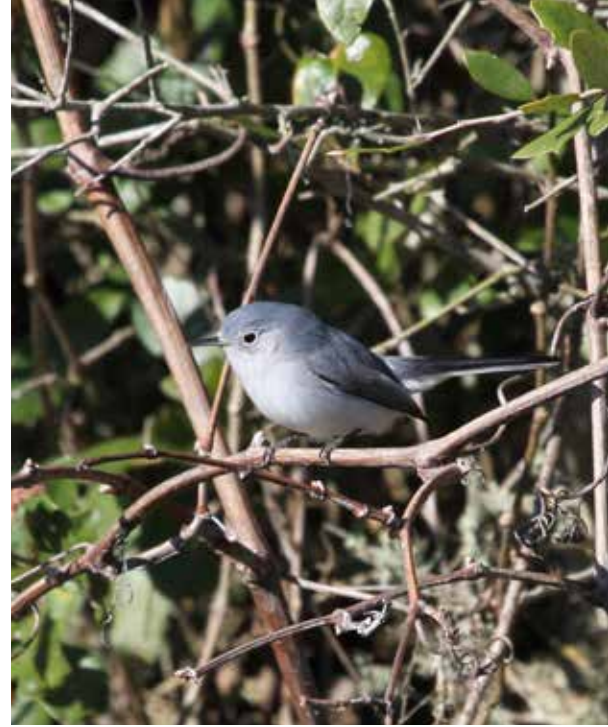
Blue-eyed gnatcatcher.

The Birding at Burden trail system can be accessed through the Ione Burden Conference Center or the LSU Rural Life Museum. Parking and restrooms are available at both locations, along with information kiosks, brochures with maps upon request and a log of recent observations. Bring along binoculars if you have them, but if you don’t have a pair, there are plenty of birds you can see at close range without them. For more information, visit our website at https://www.lsu.edu/botanic-gardens/research/birding.php . Consider sharing your experience with us on the LSU AgCenter Botanic Gardens social media pages. We’d love to hear about your adventures! ■