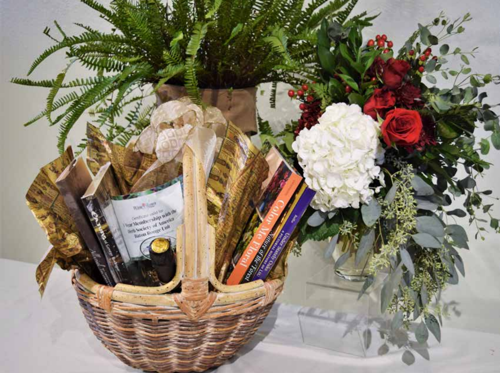
Book Lover's Basket