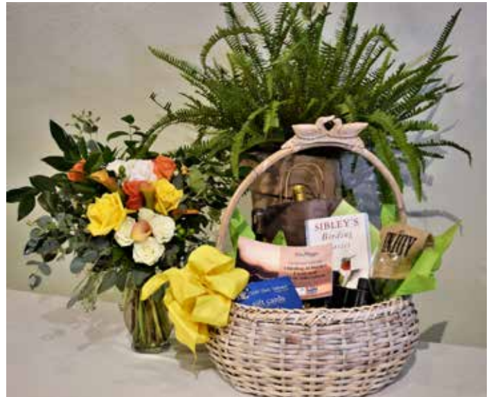
Guided Birding at Burden Basket

We have added a special twist to the annual Wine and Roses fundraiser — a virtual raffle. The Friends of LSU AgCenter Botanic Gardens at Burden have designed 20 themed baskets. Each basket has two wine glasses, a bottle of wine and a bouquet of roses. In addition, each basket will include a variety of items to go with its theme, such as a birding basket, Louisiana artist basket, a picnic at Burden basket and a wellness basket, just to name a few. You can purchase raffle tickets by visiting the LSU AgCenter Botanic Gardens website, lsuagcenter.com/botanicgardens . The website includes a photo and a description of each basket. Ticket prices start at $25 for one ticket, 15 for $200 and 30 for $300. Don't miss this opportunity to sit back, sip some wine and support the LSU AgCenter Botanic Gardens. ■