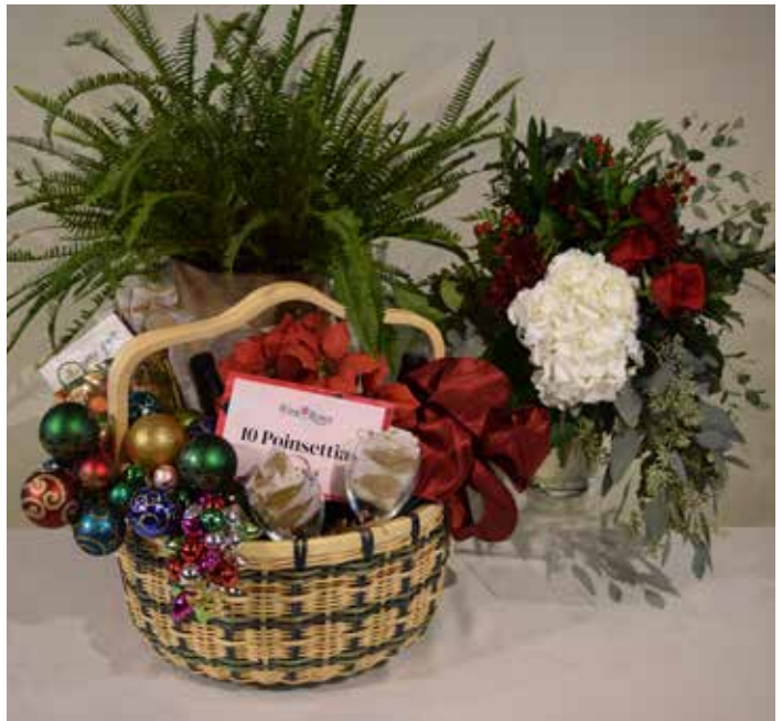
LSU AgCenter Poinsettia Basket