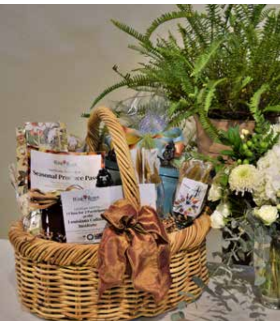
Culinary Creator Basket