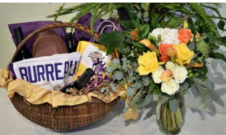
Bleed Purple and Gold Basket