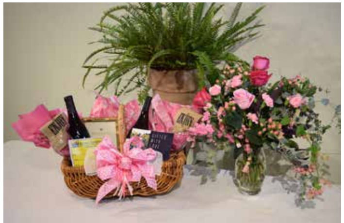
Family Photography Basket: Featuring Kaela Rodehorst