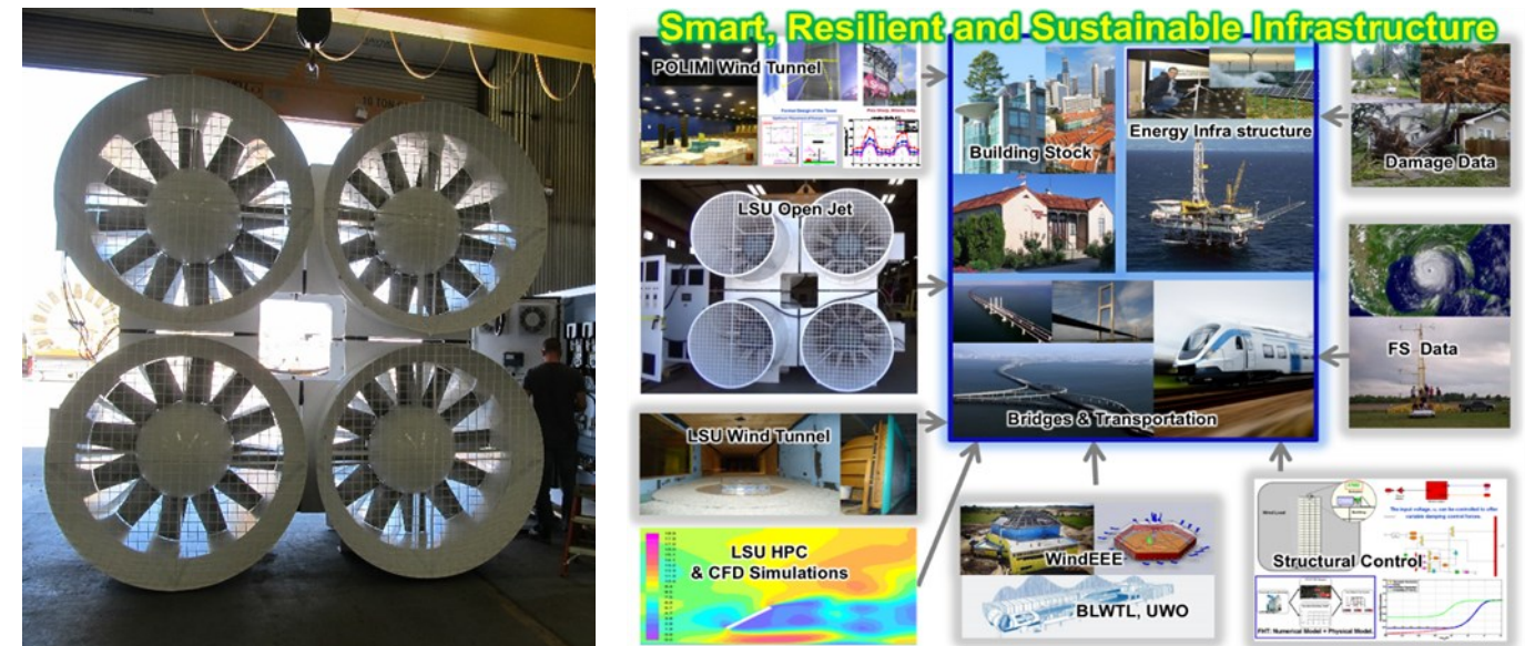
LSU large-scale windstorm testing facility and long-term economic development goals.

It will also enable scientists and researchers to test potential mitigation and restoration solutions, both natural (e.g., vegetation) and artificial. Potential applications include, but are not limited to, wind turbines, solar panels, residential homes, large roofs, high-rise buildings, transportation infrastructure, power transmission lines, etc. The research activities will provide knowledge useful for homeowners, local governments, and insurance companies to deal more effectively with storms, for example, it will assist officials and decision makers to fine-tune design codes, and give coastal residents options for making their dwellings more storm resistant. The goal is to build new structures and retrofit existing ones in innovative ways to balance resilience with sustainability, to better protect people, and reduce loss of life and the huge cost of rebuilding after storms. This will broadly impact the wind/structural engineering research field, and facilitate effective investments in the infrastructure industry that result in more resilient and sustainable communities and contribute to economic growth, and improve the quality of life.